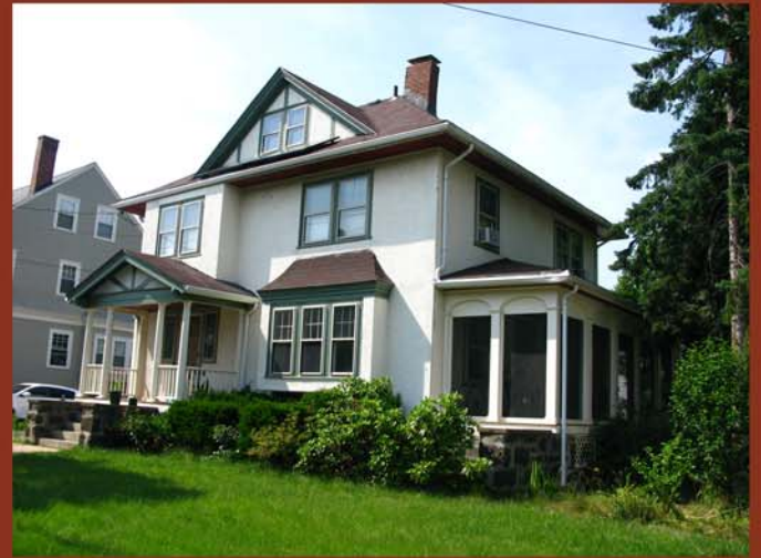
Photo of the building (right) and historic image and information (below).

Building sits among an enclave of late nineteenth and early twentieth century buildings.